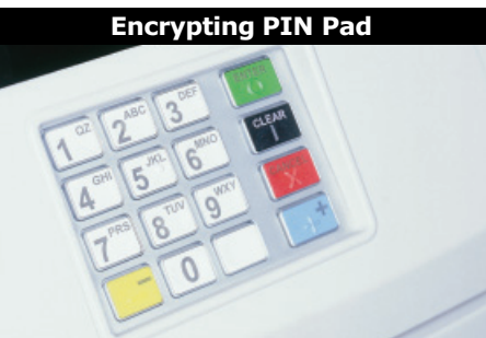
Encrypting PIN Pad